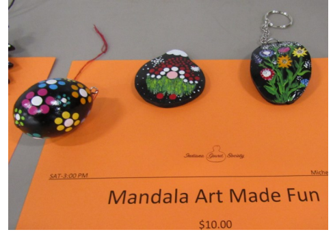
Mandala Art Made Fun $10.00