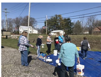
Marbleizing at Gourd Crafters Patch Meeting