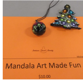
Mandala Art Made Fun $10.00