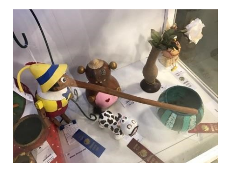
Sorry for the bad lighting, the art gourds were behind glass in a case.