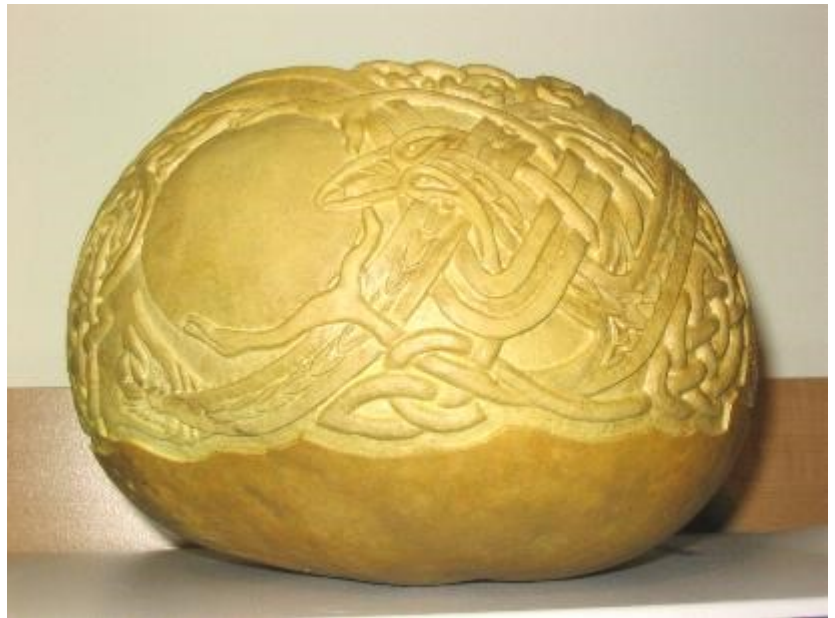
Have you seen the watermelon carvings on cruise ships at the mid-night buffet? Did you know you can do a similar carving on gourds? This is by Gary Devine (Canada) from the 2004 IGS State Gourd Show.