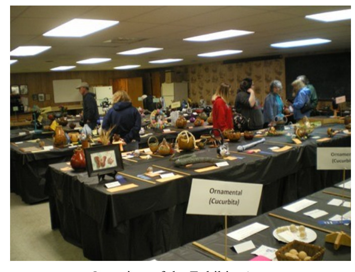
Overview of the Exhibits Area