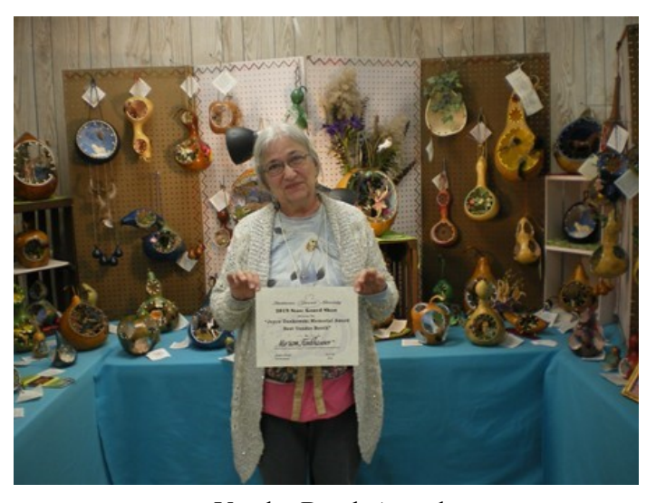
Vendor Booth Award: