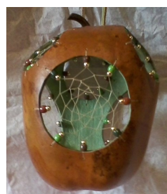
C: $25 11 a.m.—2 p.m. Fankhauser