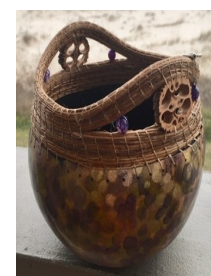
C: $35 1:30—4 p.m. Fife