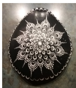
B: $25 2:30-5:30 p.m. Moore