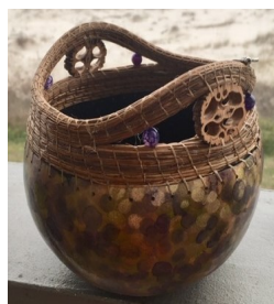
C: $35 2:30-5:30 p.m. Fife