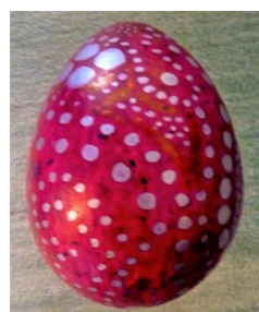
B: $20 11 a.m.—1 p.m. Werblo