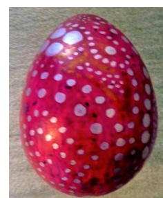
B: $20 1:30—3:30 p.m. Werblo