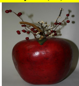
A: $35 2:30-5:30 p.m. Scott