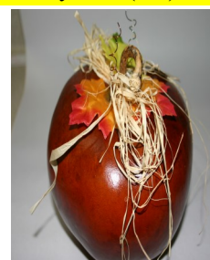
A: $35 1:30-4 p.m. -Scott