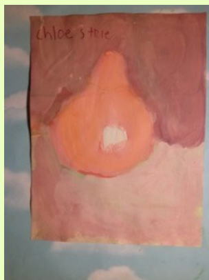
Gourds painted by local art students in grades 2 and 3.