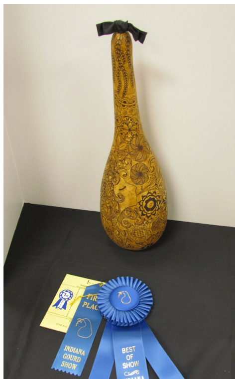
Bobbie Lee Best of Show—Intermediate