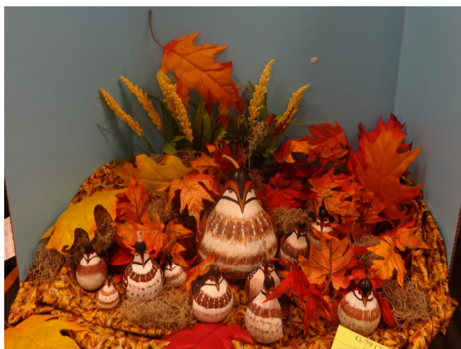
Sugar Creek Best Of Show—Gallery