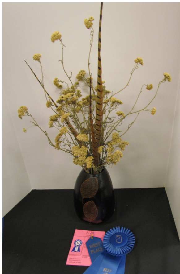
Gwen Niedermeyer Best of Show—Botanicals