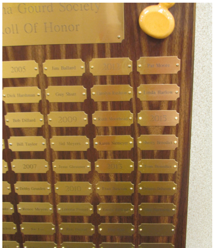
The Roll of Honor