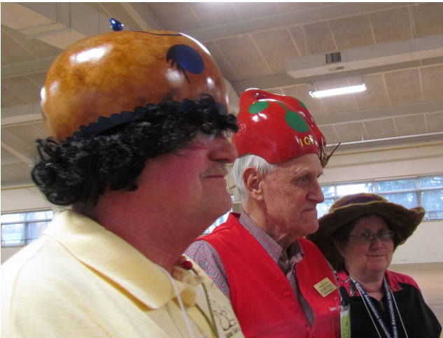
The hat contest