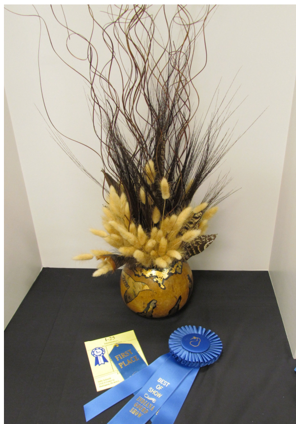
Sally Schmidt Best of Show—Floral