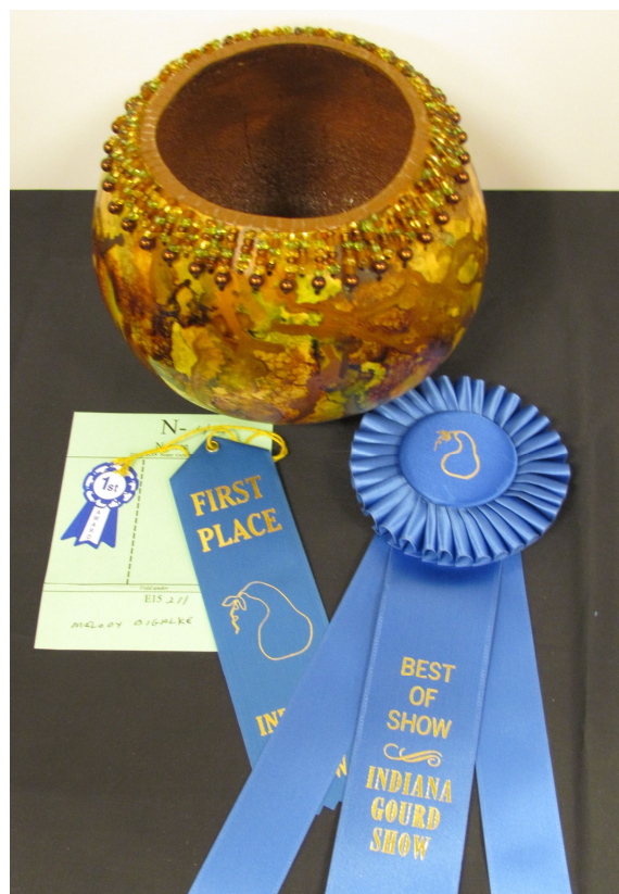
Melody Bigalke Best of Show—Novice