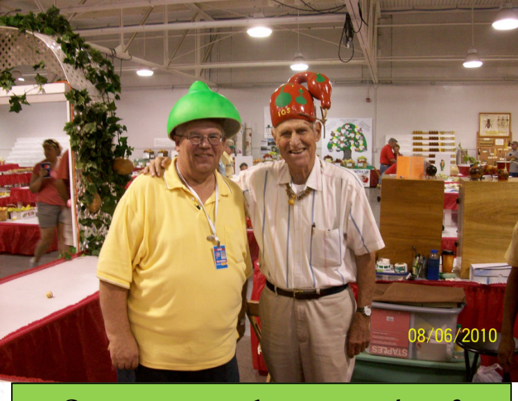
Do you recognize these two gourd nuts?

Note: Items over budget were approved by board vote.