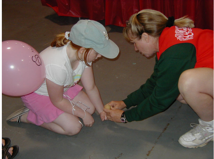
Do you recognize who is helping the girl spin?

Note: Items over budget were approved by board vote.