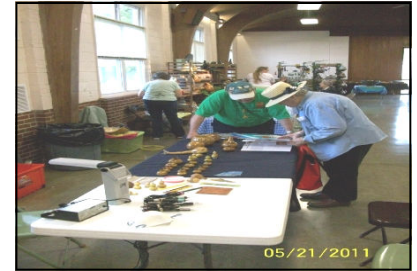
There were also many displays to see and ask questions of the experts..