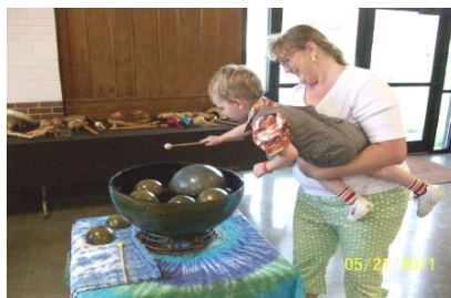
All boys like noise makers and the drums delighted "The Little Drummer Boy" & it looks like Mom enjoys it!