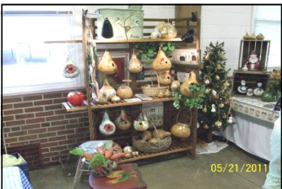
Lot's of birdhouses around the show, but, YUM, look at those carrots! Now how did they grow like that?