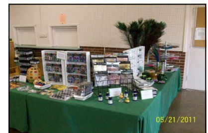
Of course you need to dress up all of those gourds you have with a bit of paint, gold leaf, feathers, or lace too.