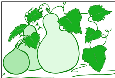
Sugar Creek Gourd Patch

Included with this column is a graphic from the Sugar Creek Gourd Patch, a gourd group that meets at the Thorn-