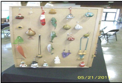
WOW! Lures, carrots, Santa, necklaces, baubles, and snowmen all on one board and it actually looks very