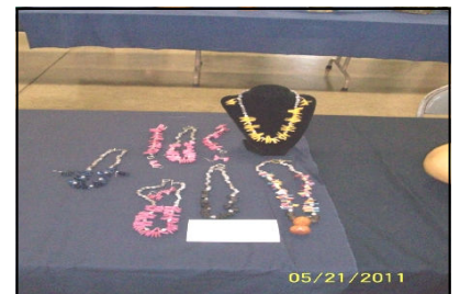
A very nice display of a variety of gourd seed necklaces. These have Jobs' Tears half way down for comfort.