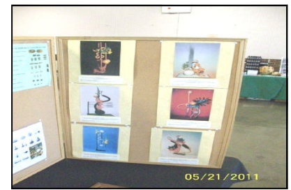
And these are the long-handled gourds shaped and crafted into jewels of flower containers and decorative