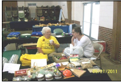
There was time for chatting with friends and catching up on all the news.