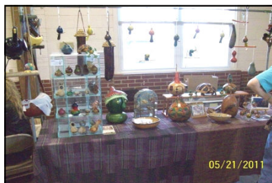
The birds were sitting watching everyone go by. Hey, if you Tweet, have a Tweety Bird gourd nearby.