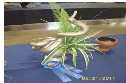
There's always a new twist on what you can do with gourds isn't there?