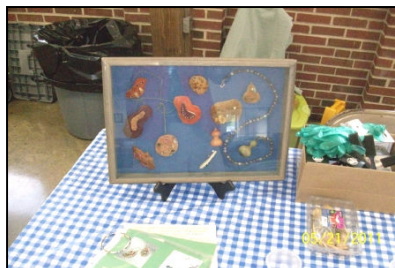
A very nice show case of gourd jewelry pieces and necklaces attracted many festival attendees.