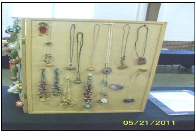
Gourd related necklaces, decorative pieces, and gourd jewelry pieces. Some very imaginative crafting here!