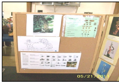
This story board was all about gourd seeds, gourd varieties, and growing.