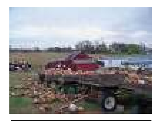
Gourds blown everywhere.