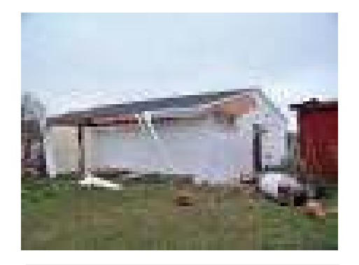
Shop's south side damage.