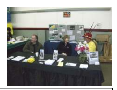
The Hancock County Visitors Bureau worked with the co-chairs with community involvement.