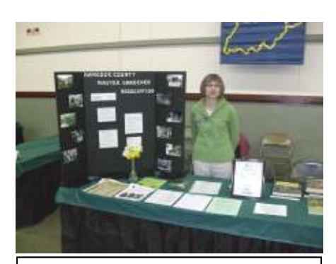
Greenfield Master Gardeners representatives were present at the 2011 Show.