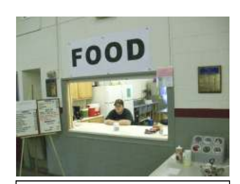
And, it was great to be able to take a break and have a meal or just a cup of coffee.