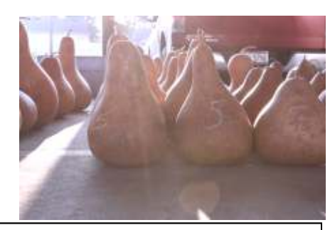
We start off with our raw gourd vendors as that is where our artists begin their fabulous work following.