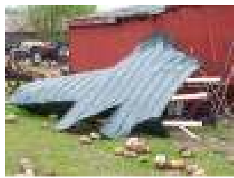
Deck roof blown 300 feet by barn.