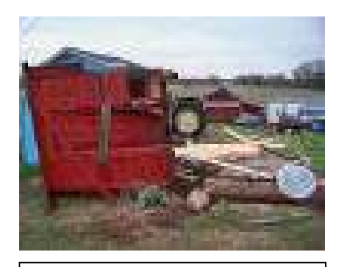
Old outhouse knocked down.