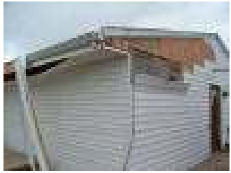
Shop SE side siding blown off.