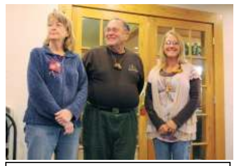
The Necklace Contest