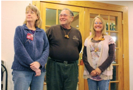
The Necklace Contest