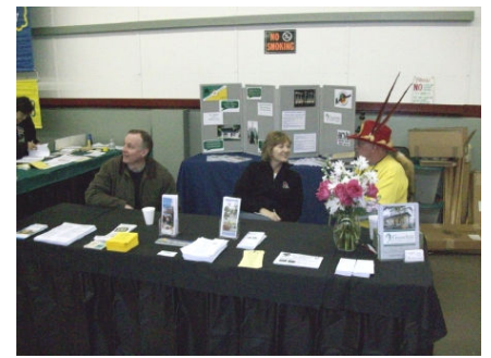
The Hancock County Visitors Bureau worked with the co-chairs with community involvement.