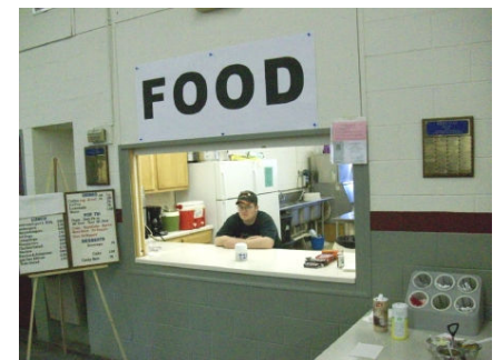
And, it was great to be able to take a break and have a meal or just a cup of coffee.