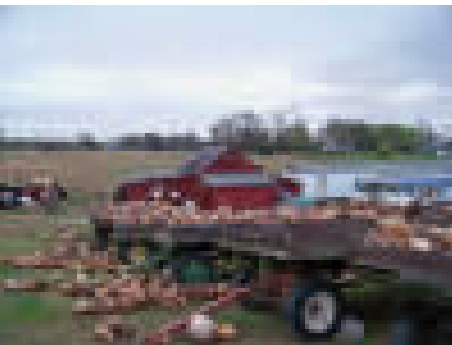
Gourds blown everywhere.