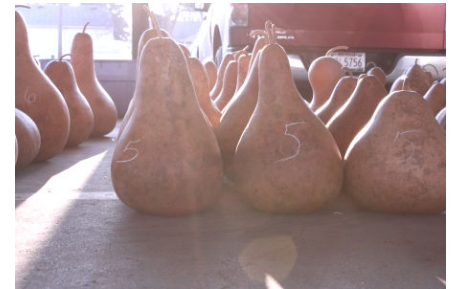
We start off with our raw gourd vendors as that is where our artists begin their fabulous work following.