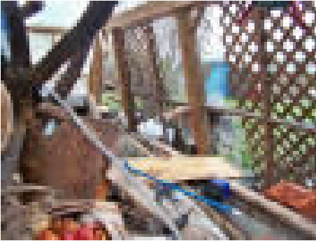
Shelves dumped on walk way.