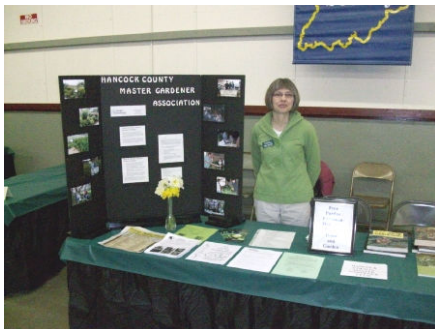
Greenfield Master Gardeners representatives were present at the 2011 Show.