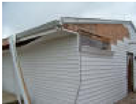
Shop SE side siding blown off.