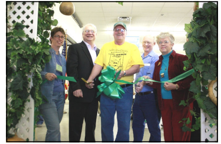
Ribbon cutting ceremony on Friday morning opened the show to the public.