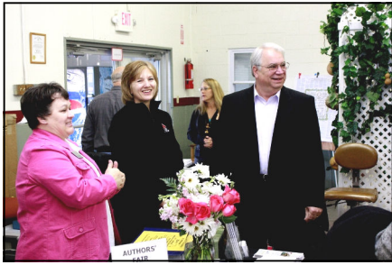
HCVB Representatives greet Greenfield Mayor, Brad DeReamer