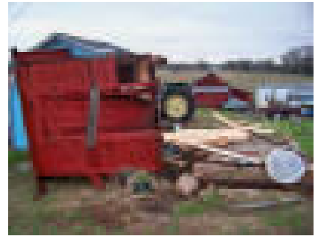
Old outhouse knocked down.