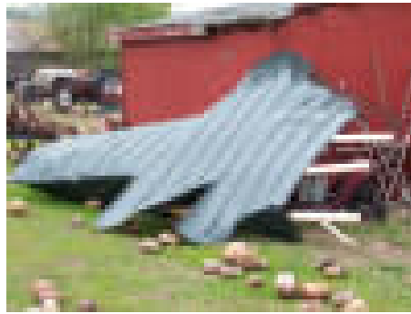
Deck roof blown 300 feet by barn.