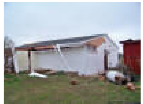
Shop's south side damage.