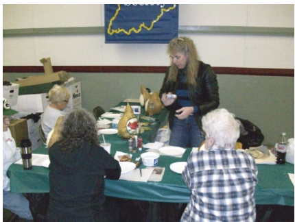
Here are just some of our workshop Instructors—always teaching—some with the very latest techniques and others teaching older techniques to people new to gourding.