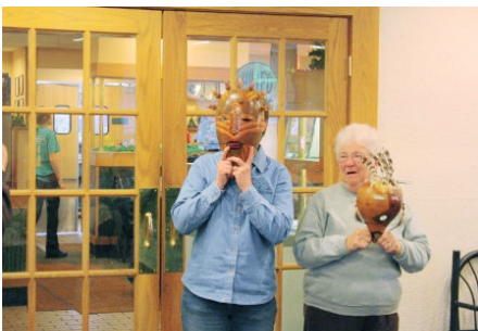
The Mask Contest