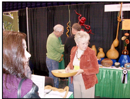
A busy time in the booth most of the day.