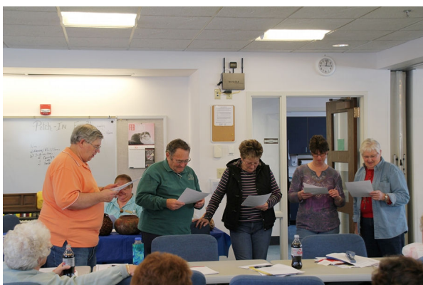
Reading to the crew from the Judging "Bible"

Wow! From those expressions above, this Judging stuff must be some really serious business!