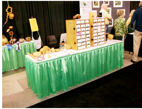
Our Seed Sales and Touchy/Feely Table Right: Volunteers Karen & Verona correcting paperwork.