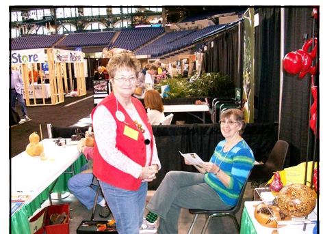
Well, when not waiting for customers.