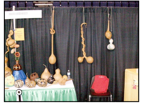
The Dipper's on the wall fascinated many.

The Flower & Garden Show at the Lucas Oil Stadium in downtown Indy was a busy time. We had many volunteers and lots of people stopping by who never knew that the Indiana Gourd Society even existed, let alone knowing much about gourds. They were "educated" and invited to attend the State Show in April to see more of what we are about.