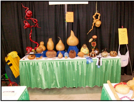
Our crafted gourds display table.

The Flower & Garden Show at the Lucas Oil Stadium in downtown Indy was a busy time. We had many volunteers and lots of people stopping by who never knew that the Indiana Gourd Society even existed, let alone knowing much about gourds. They were "educated" and invited to attend the State Show in April to see more of what we are about.