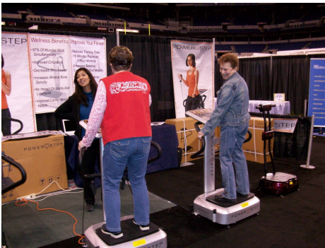
Hours of standing on cement and these vibrator/massagers felt great to several