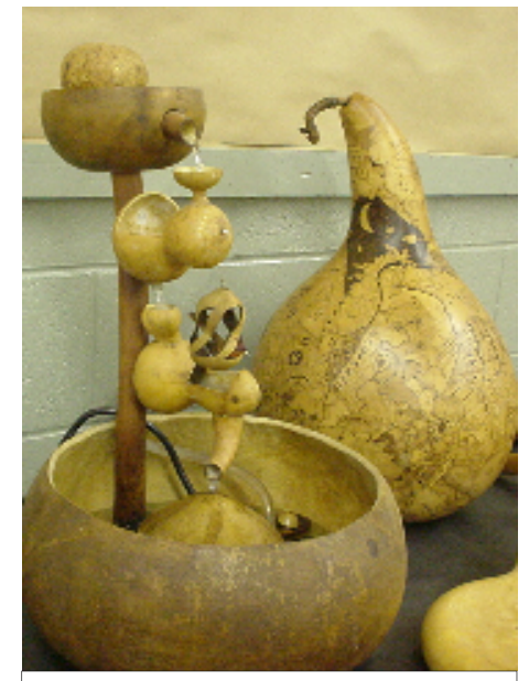
Who said you couldn't make a waterfall from a bunch of gourds? Here it is in living color and working very well, thank you!