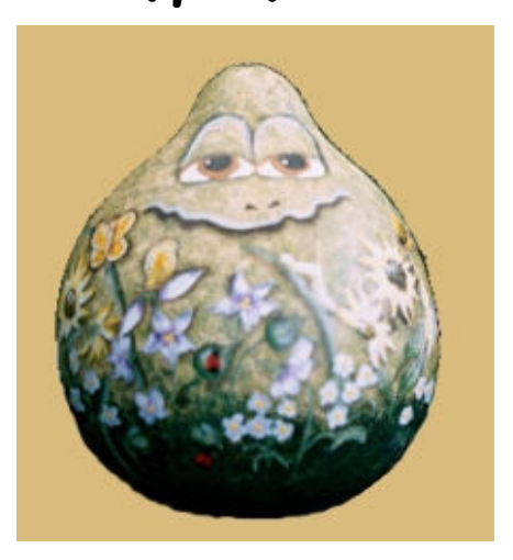
Show Me - 2008