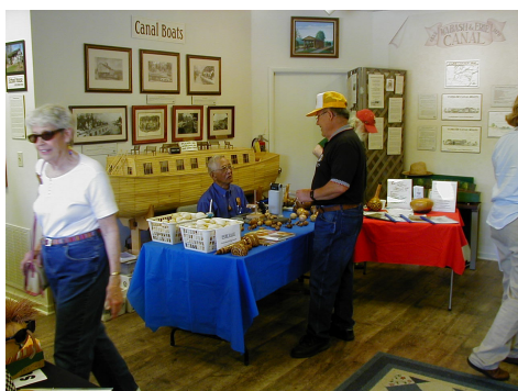
Patch 6 - Spring Festival Huntington, IN