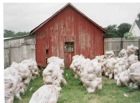
The Sand Lady Gourd Fest - 2004 Bagged and Ready