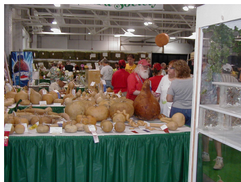
2005 State Fair Full House