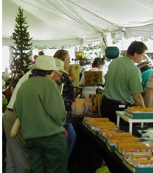
Spring Meeting at Indianapolis 2004